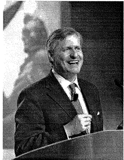
Jon Meacham Editor, Newsweek

On why he wrote the book, Meacham said, "My view of Andrew Jackson is that any president who tries to attack his own assassin, who has two bullets in him, who fought a dozen duels, who married his wife before she was divorced from her first husband and who threatened to kill his own vice president is worth a book."